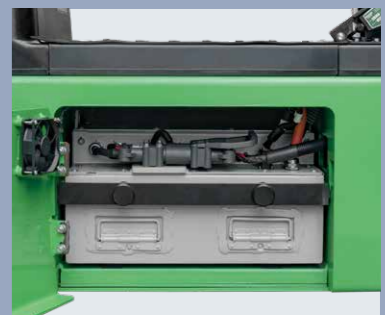
Lithium battery pack