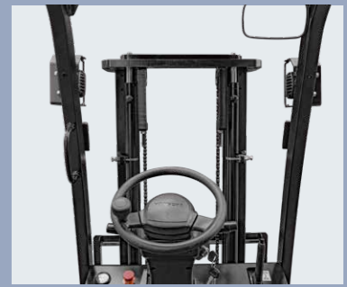
Wide view mast

/ The optimized design of the wide-view mast and the low dashboard enable a wide front view and higher safety, and minimizes the blind view to the greatest extent. / The emergency power-off switch complies with European safety standards. / The electronic and hydraulic overload protection comply with safety regulations. / OPS system(Opt.) can improve safety greatly.